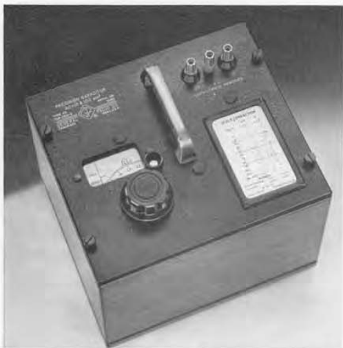
Figure 1. Panel view of the Type 722-ME Precision Capacitor.

The new TYPE 722-MD Precision Capacitor replaces the TYPE 722-M. This new model has the 0-1000 \mu\mu\text{f} \Delta C range of the model it replaces but has, in addition, a 0-100 \mu\mu\text{f} \Delta C range. The second model, TYPE 722-ME, has 0-100 \mu\mu\text{f} and 0-10 \mu\mu\text{f} sections. The 10- \mu\mu\text{f} section represents the first regular listing of this low, full-scale value. Such units have in the past been available only on special order.