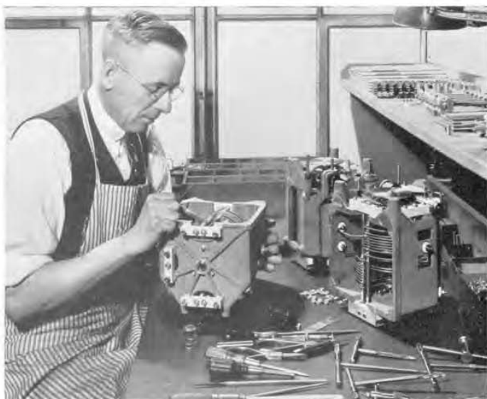
Figure 1. The accuracy and stability of a precision capacitor depend to a great degree upon the care and skill with which it is assembled and aligned. Here, a skilled machinist is assembling a group of capacitors for installation in heterodyne frequency meters.

This may be almost any figure within the limits of 1 \mu\text{mf} and 1000 \mu\text{mf} . The capacitance-rotation curve is essentially a straight line except at each end where fringing causes deviations. In stock models, linearity is maintained over slightly more than 150^\circ . Capacitors are manufactured for catalog stock having straight capacitance sections spanning nominally 10, 100, and 1000 \mu\text{mf} (actually 10.5, 105, and 1050 \mu\text{mf} ). Capacitors have been built with nominal capacitance span of 1 \mu\text{mf} linear (actually 1.05 \mu\text{mf} ). If