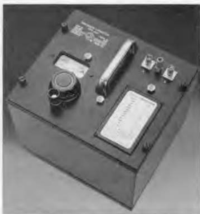
Figure 4. Panel view of a special Type 722 Precision Capacitor calibrated in direct capacitance. The coaxial terminals provide complete shielding for the leads.

frequencies) are about \frac{3}{5} of those of the large sections of other TYPE 722's. The small sections of dual capacitors have higher residuals. However, the residuals in the capacitor employed in the TYPE 821-A Twin-T are about \frac{3}{10} of those of the large sections of the usual TYPE 722, or about \frac{1}{4} of those of a TYPE 722-N. This capacitor construction, shown in Figure 2, is, although available, rather expensive, since it is not regularly made for separate sale.